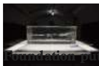
Foundation Plus ballistics test inside mothballed